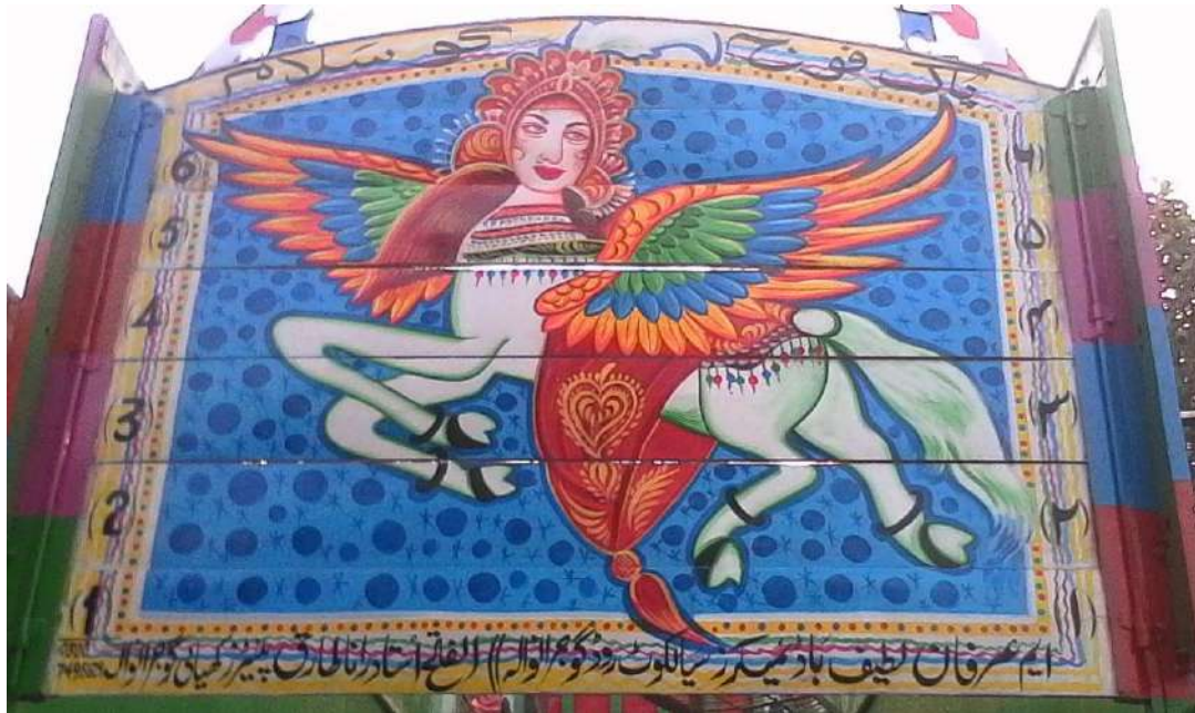
Figure 9 Burraq, the celestial horse that enriched Prophet Muhammad (PBUH) on his journey to Heaven, Rahat Afza, JPEG image

Some of the motifs, such as the partridge and the peacock are frequently represented on trucks. The category of religious symbols and images consist of the depiction of the Kaaba or the Masjid-e-Nabvi. Some other symbolic representations are also found such as crescent and star that donates Islam and Pakistan. Burraq, the celestial horse that enriched Prophet Muhammad (PBUH) on His journey to heaven is also seen on some vehicles (fig.9).