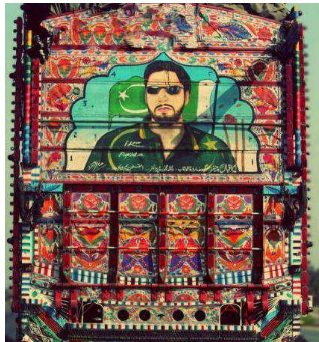
Figure 8 Portrait painting of a cricketer Shahid Afridi on the back side of a truck, Rahat Afza, JPEG image