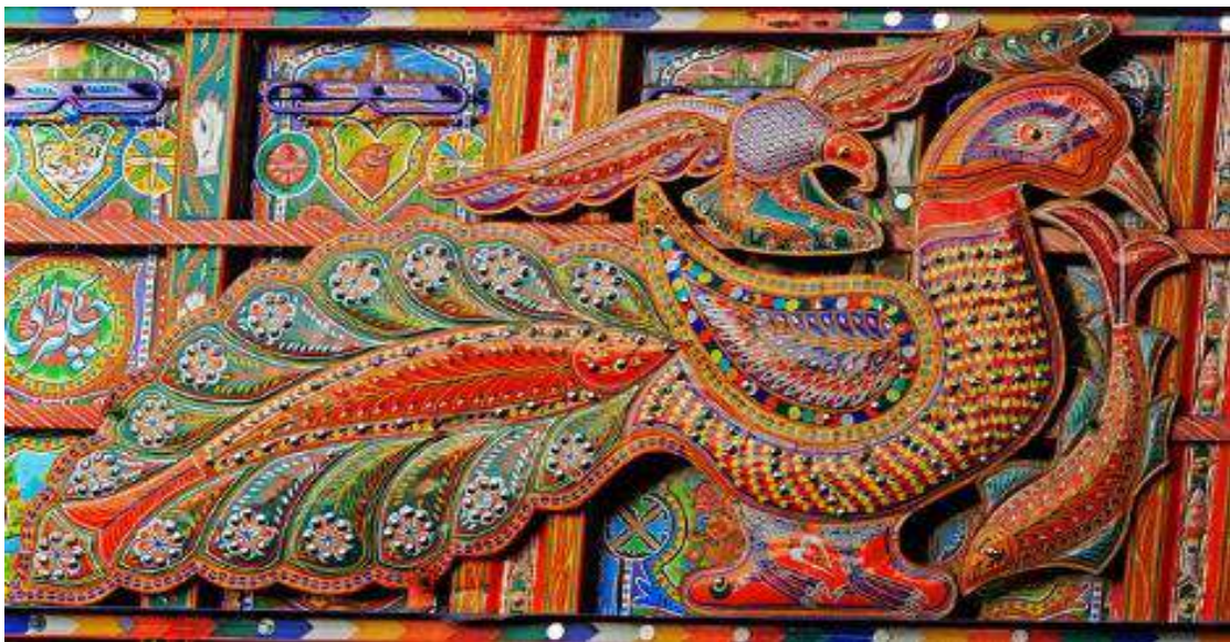
Figure 6 Peacock in metal on the truck, Rahat Afza, JPEG image

Representation of peacock also symbolizes health besides beauty and considered a symbol of royalty (figure 6). The floral motifs include various kinds of flowers like roses and lotus. Rose symbolizes love. The most commonly seen lines or quoted words are: Māṇ kī dua , Jannat kī hawā , etc. Furthermore, Punjabi phrases are so often seen like phal mosam da , gul wely dī (seasonal fruit, timely conversation) etc.