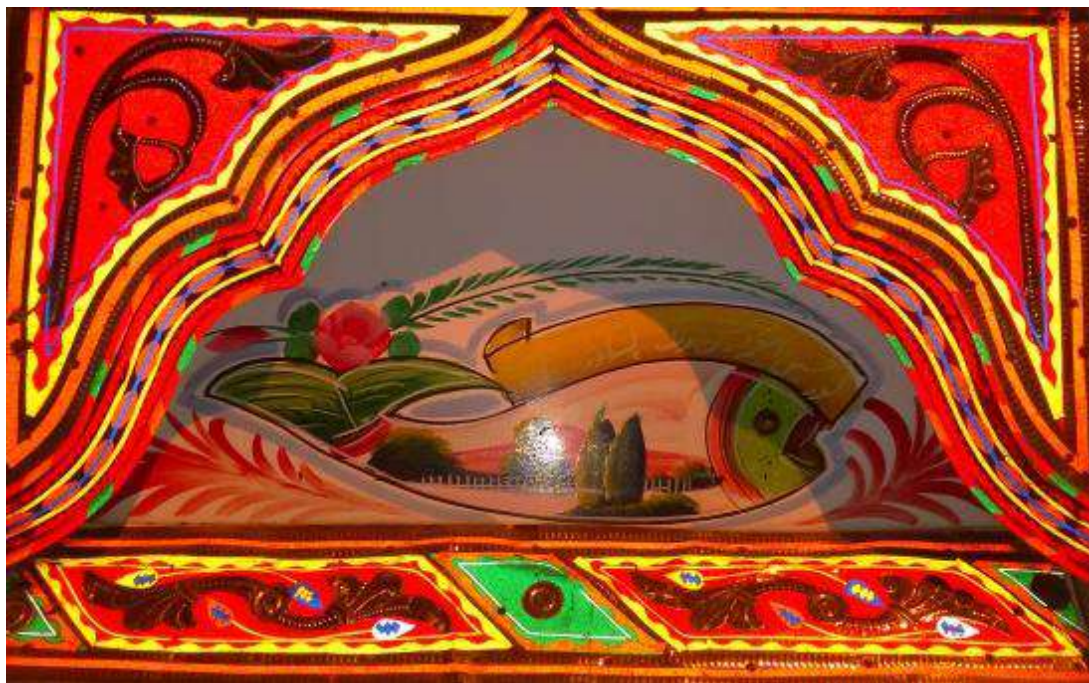
Figure 4 Painting of a Fish, Rahat Afza, JPEG image

Imported material is used to create fantastical compositions. Geometrical designs are used by the use of reflected tape. In one of a panel, an idealized fish in simplified form is painted with landscape and corners are filled with delicate metal leaves (fig 5). A fish represents good fortune while human eyes often represent protection from evil eye or so called nazar .