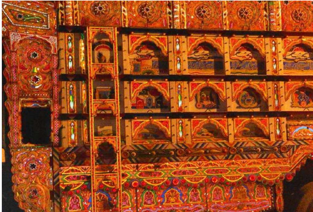
Figure 3 Beautifully decorated side wall of a truck with paint, Rahat Afza, JPEG image

Imported material is used to create fantastical compositions. Geometrical designs are used by the use of reflected tape. In one of a panel, an idealized fish in simplified form is painted with landscape and corners are filled with delicate metal leaves (fig 5). A fish represents good fortune while human eyes often represent protection from evil eye or so called nazar .