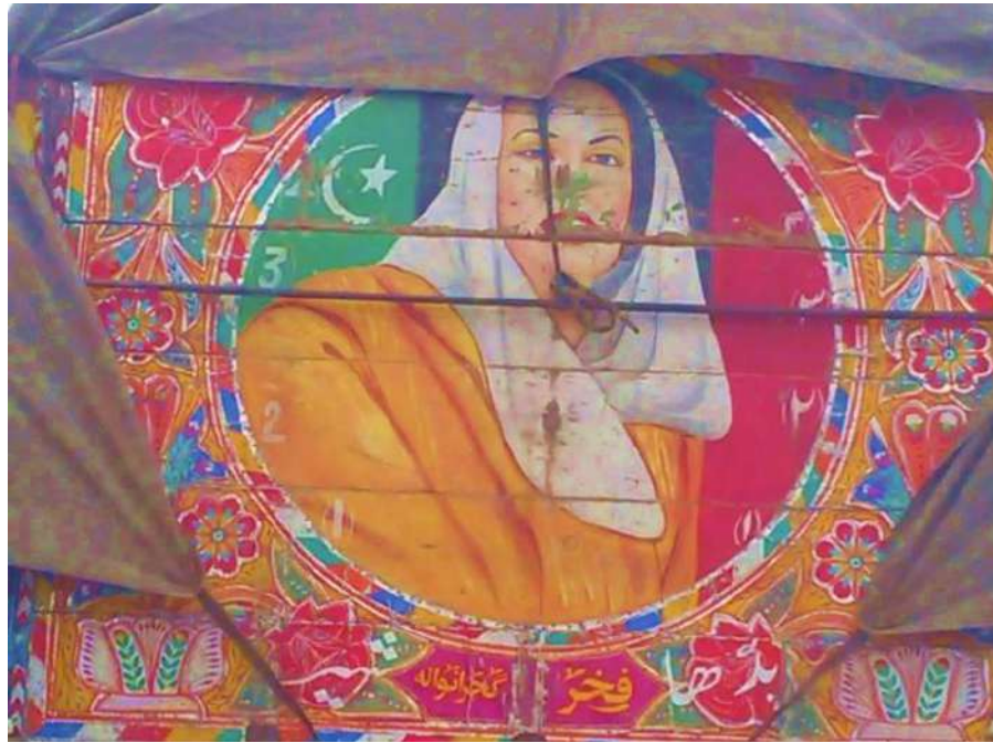
Figure 2 Portrait painting of Benazir Bhutto, a political leader of Pakistan, Rahat Afza, JPEG image.

The truck is painted according to the driver's demand, while sometimes according to the artist's choice told by Ustad Rana Tariq and Sons at Sialkot Bypass Gujranwala. Reflection of the ideology points out the area from which the truck is from.