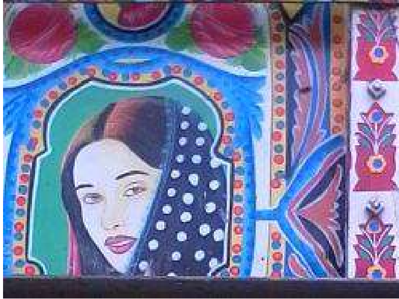
Figure 7 Idealized portrait of a woman, Rahat Afza, JPEG image

For poetry verses the truck drivers take a help of authors or writers. Side panels show painted flora and fauna representations. Most often birds are beautifully composed in a medallion. Pakistani trucks also used as means of displaying the calligraphic board as well as a notice board for public messages. A wide range of motifs are included in the category of modern elements like celebrities' pictures, Pakistani flag and portraits of national heroes like Shahid Afridi, and a beautiful eastern woman has been depicted with dopatta on her head in stylized form (figure 7 and 8).