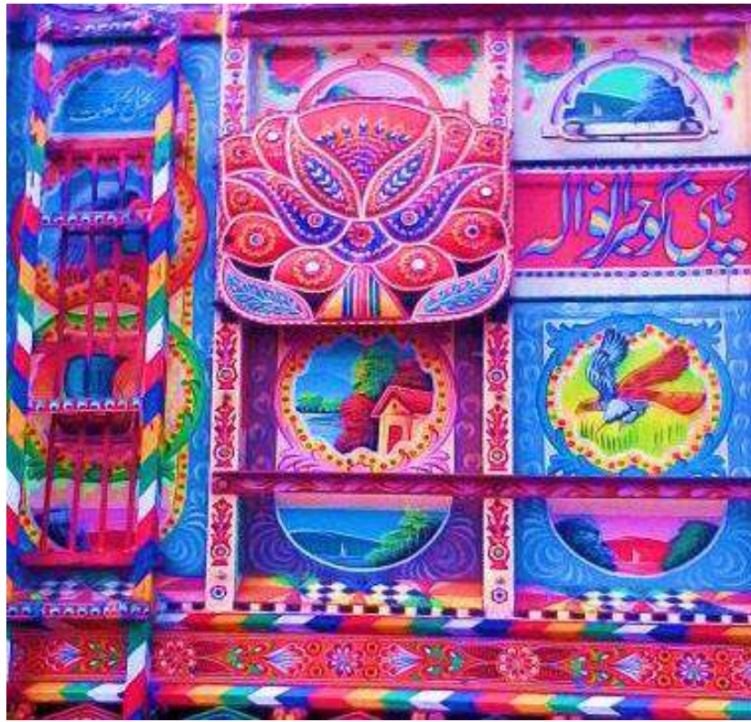
Figure 5 Decorated flower and birds on sides of a truck, Rahat Afza, JPEG image.